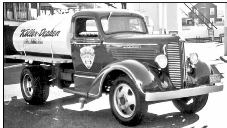
Refurnished 1938 Dodge Oil Truck was the type used by Depken Oil in the 1930's and '40's