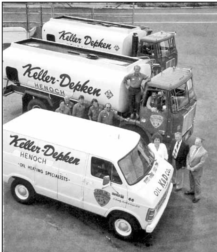
Photo used in promotional literature in the early 1980's