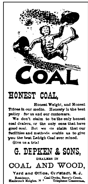
Display ad that appeared in local paper "The Newsletter" in February 17, 1900