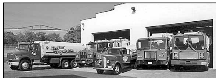
Fleet located in Passaic. Photo used in promotional literature during the early 1990's