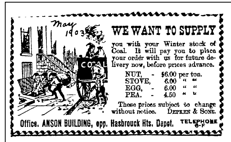
Display ad that appeared in local paper "The Newsletter" in May 1903