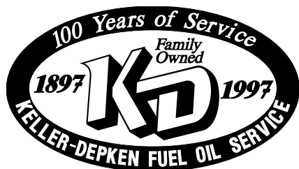
Emblem commemorating Depken's 100th Anniversary in 1997